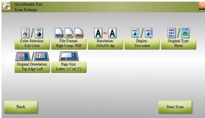
AccuSender Fax offers many user defined scan options

KYOCERA's HyPAS (Hybrid Platform for Advanced Solutions) is a powerful and scalable software solution platform. Through direct enhancement of the MFP's core capabilities, to the integration with widely accepted software applications, HyPAS will enhance your specific document imaging needs, resulting in improved information sharing, resource optimization and document workflows.